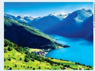
NORDIC ADVENTURE: Sail from Tilbury to marvel at Norway's fjords

Looking out for dolphins and whales from the deck of a ship is a perfect way to have fun with your children or grandchildren. And there will be experts from whale charity ORCA on board new ship Ambience to help you spot marine life on a