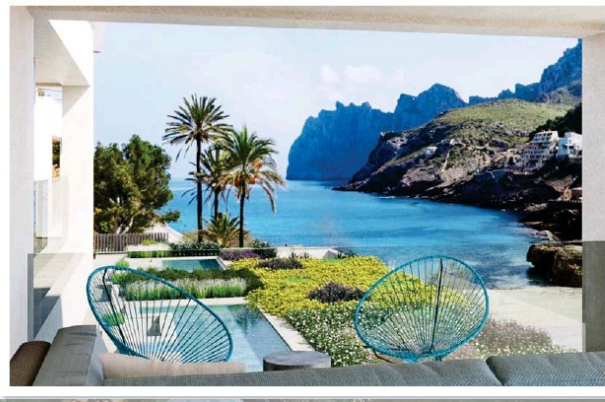
BAY OF PLENTY: View from El Vicenc, nestled in a rugged Majorcan cove. Main picture: The Cote d'Azur and, inset, the Maybourne Riviera, built into the hillside

New York continues to pulsate away. The Ned NoMad ( thenomadhotel.com/new-york ) will blend hotel guests with club members when it opens this summer near Madison Square Garden, and Aman will provide serenity and a rooftop swimming pool plus three floors of spa. Rates TBC ( aman.com/resorts/aman-new-york ). Meanwhile, the just-opened Civilian hotel off Broadway also aims to make things affordable while keeping the style levels high. There are different rates depending on which facilities you prefer, such as daily housekeeping or gym access. Doubles from £101 ( civilianhotel.com ).