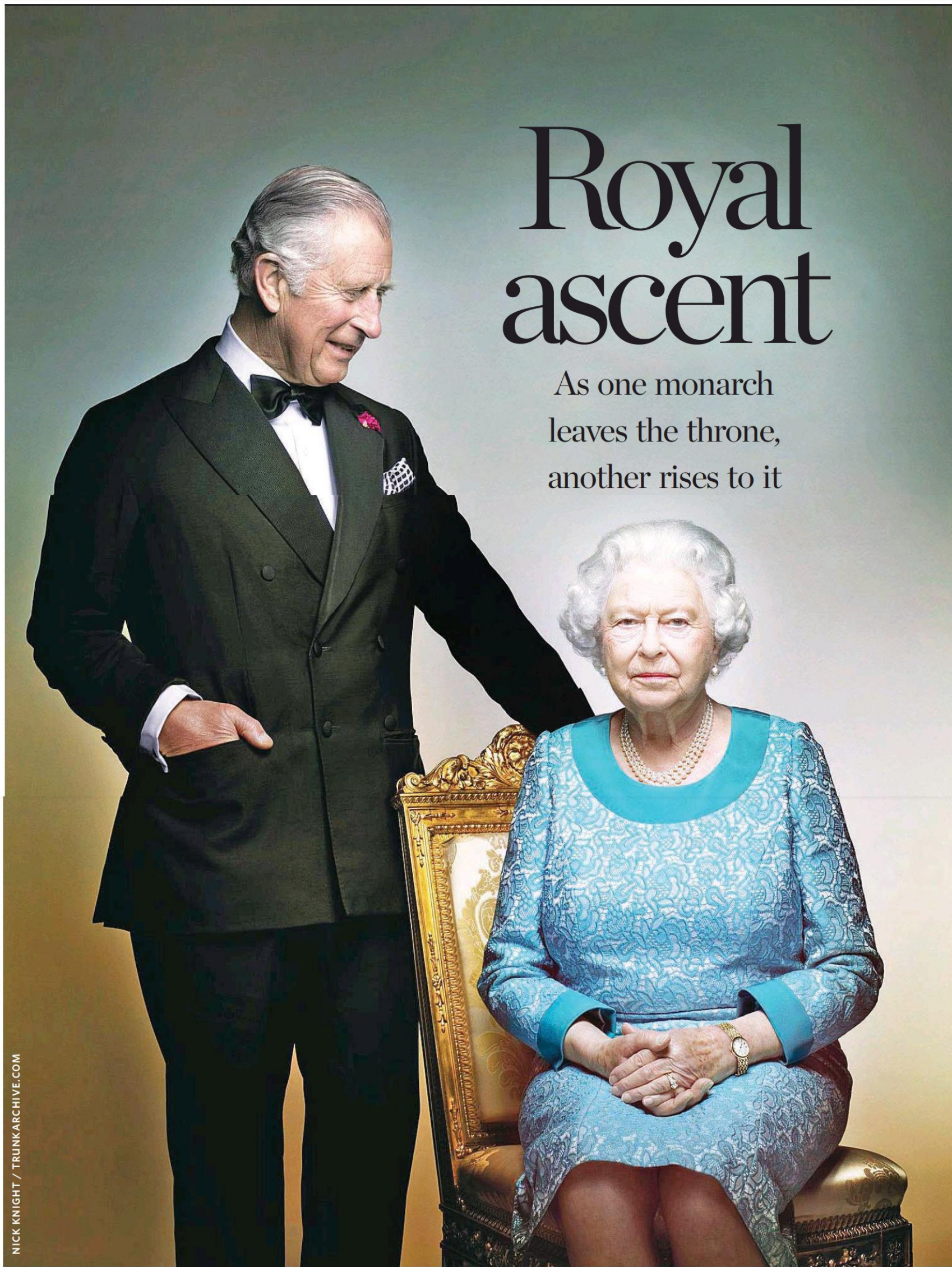
NICK KNIGHT / TRUNKARCHIVE.COM