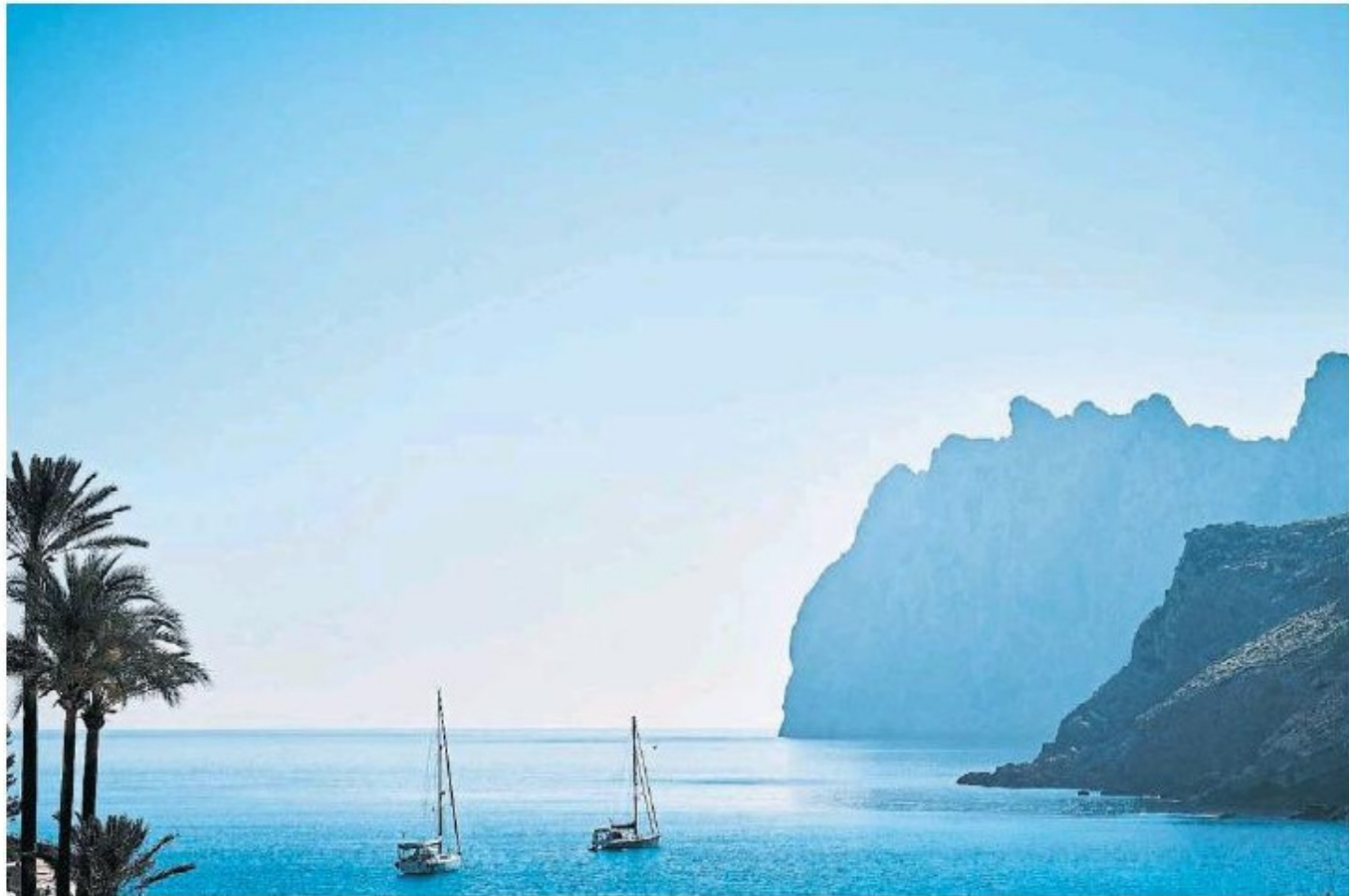
The hotel overlooks azure waters at the foot of the Serra de Tramuntana mountains.