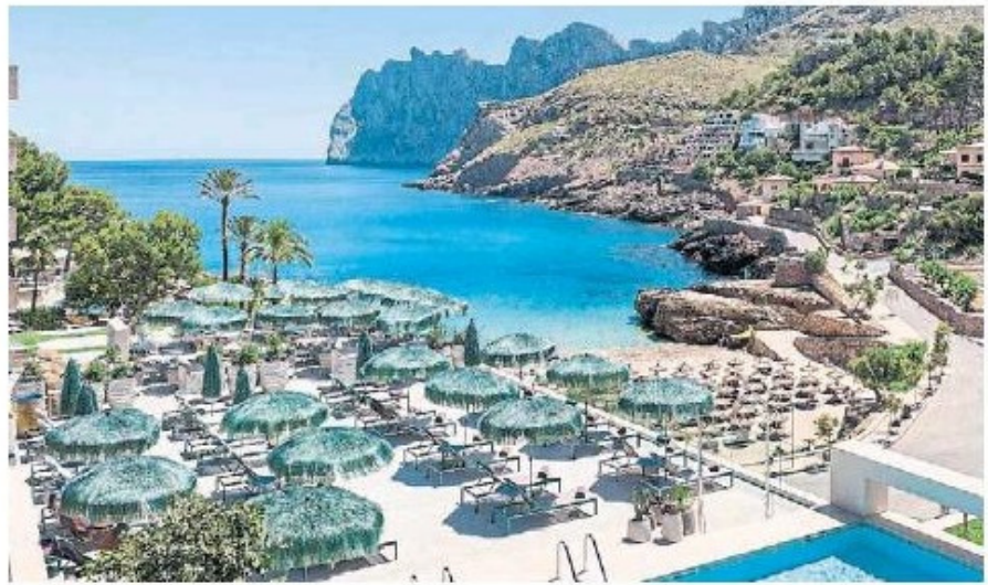
Find El Vicenç de la Mar on the bay of Cala Molins, on the northern coast of Mallorca.

Aside from its sparkling waters filled with sunken ships (yes, it's a scuba-diving hot spot), the rugged coast is home to prehistoric caves